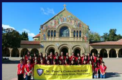
Stanford Pre-Collegiate Studies International Institutes Youth Program