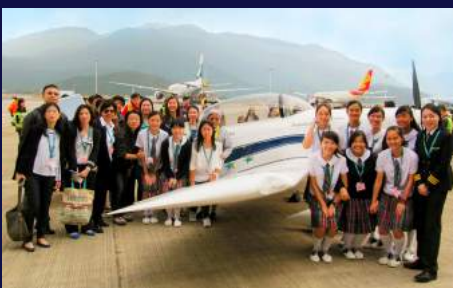
RV8 B-Koo "Inspiration" Inaugural Flight

醫務化驗科學 Medical Laboratory Science Principles of Coaching Sport 運動教練概論