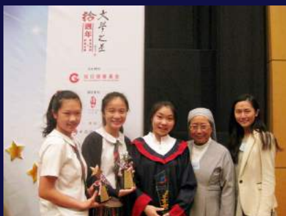
National Literary Award 中國文學之星