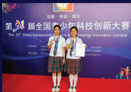
31st China Adolescents Science and Technology Innovation Contest