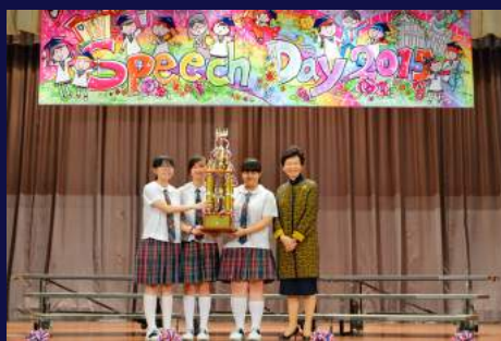
Speech Day 2015

學校貫徹以營造愉快、融洽和合作的校園文化為優先。在這氛圍下，培養學生高尚的品格、建立珍貴的友誼、發展多元潛能、進而啟動高效能的學習動機，主動地追求學業的成就及個人潛能的發展。在這正面積極的氣氛薰陶下，使學生能在嚴謹而充滿挑戰的學習課程中，奮力追求卓越。為更妥善裝備學生多元發展的途徑，本校已註冊成為英國商業及科技教育委員會(BTEC)中心，給學生提供多元化的升學及擇業機會。