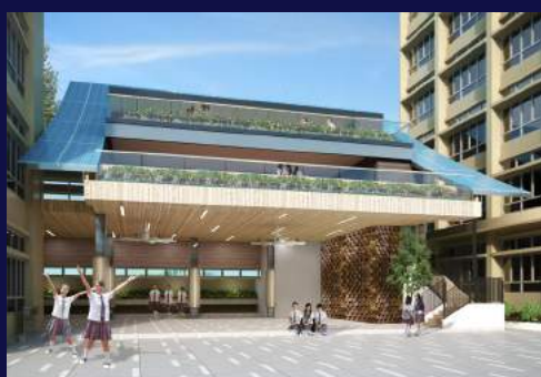
Newly built green building, the Smart Oasis