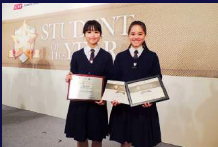
SCMP Student of the Year Awards 2015 -2016

本校已於二〇〇四年九月起轉制，由過往的補助學校，轉為直接資助學校。此項轉變使本校在辦學方面獲更大的靈活性，充分發揮其辦學理念及使命，以繼續發展聖保祿學校備受本地及國際著名學府認可的卓越全人教育。這種鍥而不捨追求高效能及卓越的信念，有助學校提高教育質素，達至世界級水平，並在二十一世紀堅定不移。