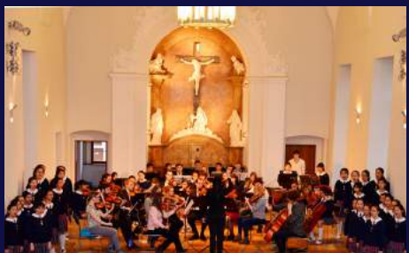
Choir and Orchestra Performance with Symfonicky Orchestra Sokola in Brno Concert Hall, Czech

聖保祿學校是以「學習為本」，在一個持續學習的世界中，邁向一個學習的新紀元。其價值取向就是誠信、喜悅、樸實、勤奮及卓越。