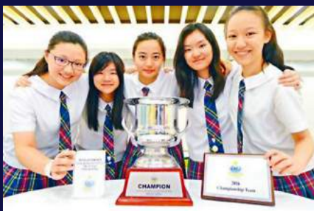
2016 Hong Kong Inter-School Mock Trial Championship Champion Team