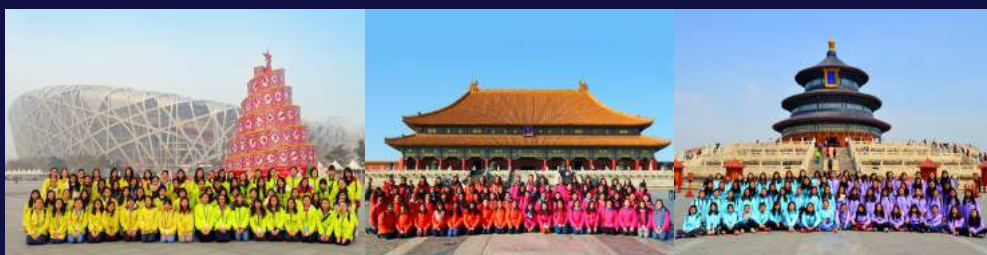
Beijing Tsinghua University Putonghua Immersion Course