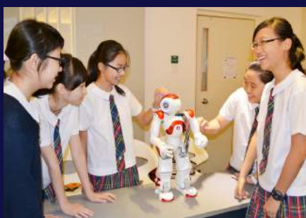
Teaching Paulina, the robot, to dance and sing

聖保祿學校作為「資訊科技卓越中心」，致力推廣在教與學中應用移動學習及資訊科技。本校支援學生網上學習，並引入嶄新的校本電子書研發項目，激發學生創意思維、提升批判性思考能力、媒體欣賞及創作能力。成為政府資訊科技總監辦公室選為合作夥伴學校之一，學校獲得港幣500萬元的資金，以便於2015/16至2022/23學年間提供資訊科技增潤培訓予我們的中二至中六學生，這將助長整體資訊科技氣氛、激發對資訊科技的興趣和於校園社區中發掘資訊科技人才。