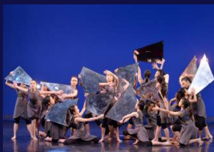
The 52nd Hong Kong Schools Dance Festival Modern Dance Section - Overall Champion