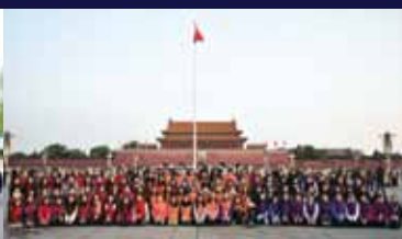
Beijing Tsinghua University Putonghua Immersion Course