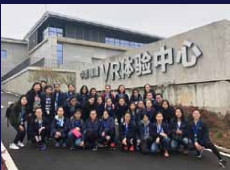
Fuzhou VR Experimental Camp