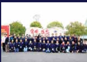
Sichuan Service Tour