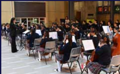
Joint School Music Competition 2018 Champion