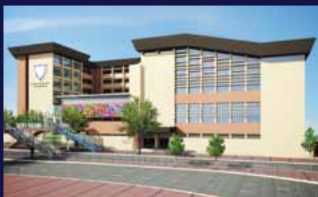
Newly built green building, the Smart Oasis

聖保祿學校是以「學習為本」，在一個持續學習的世界中，邁向一個學習的新紀元。其價值取向就是誠信、喜悅、樸實、勤奮及卓越。