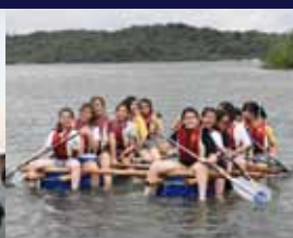
Leadership Training Camp