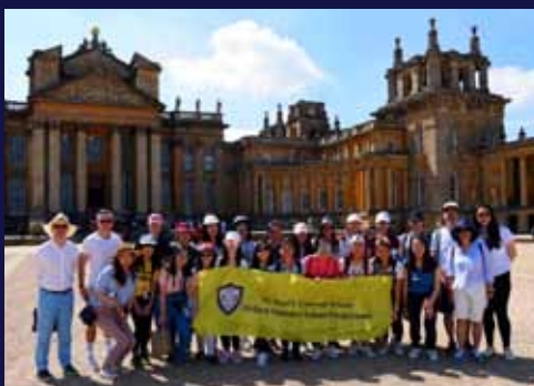
Oxford STEM Tour