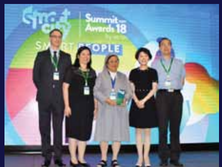
etnet Smart City: Smart People Award Outstanding STEM Education School

聖保祿學校作為「資訊科技卓越中心」，致力推廣在教與學中應用移動學習及資訊科技。本校支援學生網上學習，並引入嶄新的校本電子書研發項目，激發學生創意思維、提升批判性思考能力、媒體欣賞及創作能力。成為政府資訊科技總監辦公室選為合作夥伴學校之一，學校獲得港幣500萬元的資金，以便於2015/16至2022/23學年間提供資訊科技增潤培訓予我們的中二至中六學生，這將助長整體資訊科技氣氛、激發對資訊科技的興趣和於校園社區中發掘資訊科技人才。