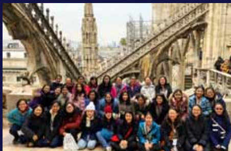
Italy Music Tour 2018