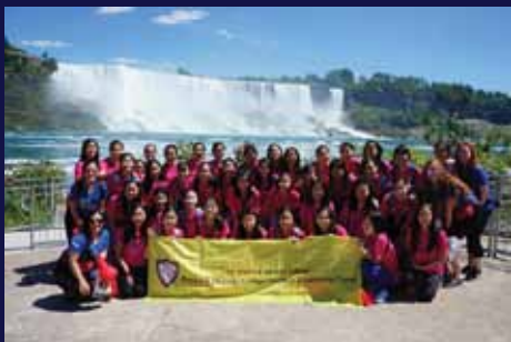
Brescia Girls LEAD Laedership Training Programme 2018

學校貫徹以營造愉快、融洽和合作的校園文化為優先。在這氛圍下，培養學生高尚的品格、建立珍貴的友誼、發展多元潛能、進而啟動高效能的學習動機，主動地追求學業的成就及個人潛能的發展。在這正面積極的氣氛薰陶下，使學生能在嚴謹而充滿挑戰的學習課程中，奮力追求卓越。為更妥善裝備學生多元發展的途徑，本校已註冊成為英國商業及科技教育委員會(BTEC)中心，給學生提供多元化的升學及擇業機會。