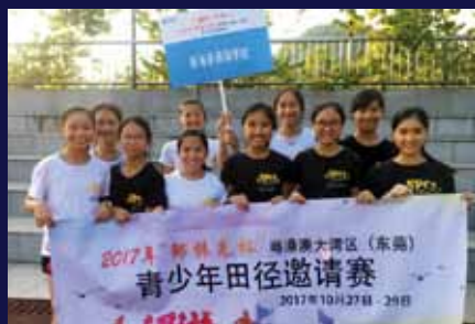
Greater Bay Area Zou Zhenxian Cup (Guangdong) Youth Athletics Invitation Tournament