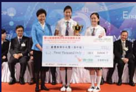
Hong Kong Youth Science and Technology Innovation Competition (2017-2018) 1st Place