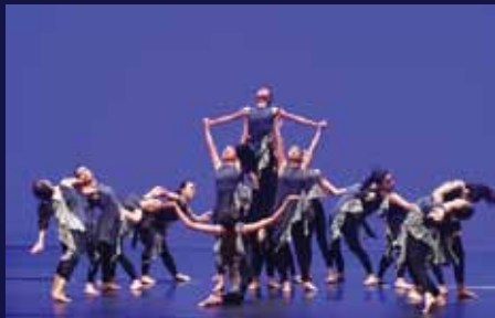
The 54th Hong Kong Schools Dance Festival Modern Dance - Honours & Choreography Awards