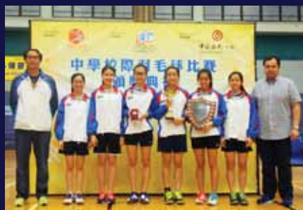
The Inter-School Badminton Competition Champion