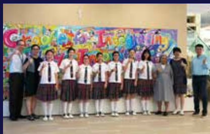
Future Engineer Grand Challenge First Class Award