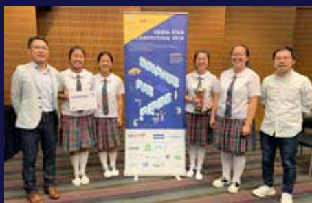
Innovate for Future Competition Champion

醫務化驗科學 Medical Laboratory Science Sport 體育運動