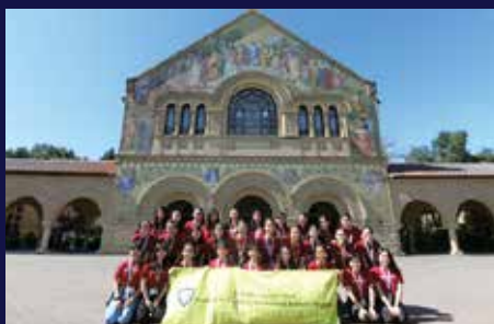
Stanford University Pre-Collegiate International Program