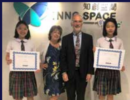
AiTLE & William Jessup University: 1 Million HKD Scholarship Computer Science Competition for High School students Champion