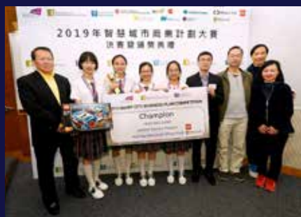
Smart City Business Plan Competition Champion