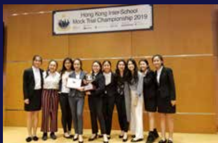
Hong Kong Inter-School Mock Trial Championship 2019 Champion