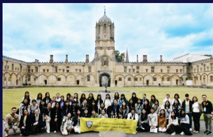
University of Oxford, Christ Church College STEM and Entrepreneurship Summer School Programme 2024