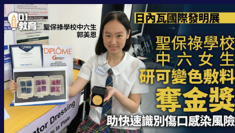
The 49 th International Exhibition of Inventions Geneva Gold Award

聖保祿學校以「學習為本」，在持續學習的世界中，邁向一個學習的新紀元。我們的價值取向就是誠信、喜悅、樸實、勤奮及卓越。