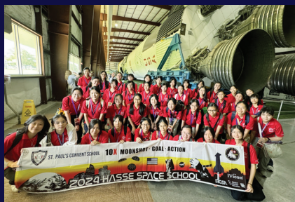
Houston Space Programme 2024

學校貫徹以營造愉快、融洽和團結的校園作為重要發展方向。在這氛圍下，能培養學生高尚的品格、建立珍貴的友誼、發展多元潛能、進而提升學習動機，主動地追求學業成就及個人潛能的發展。在正面積極氣氛的薰陶下，學生能在嚴謹而充滿挑戰的學習課程中，奮力追求卓越。為了進一步使學生擁有多元發展的途徑，本校已註冊成為英國商業及科技教育委員會(BTEC)中心，給學生提供多元化的升學及擇業機會。