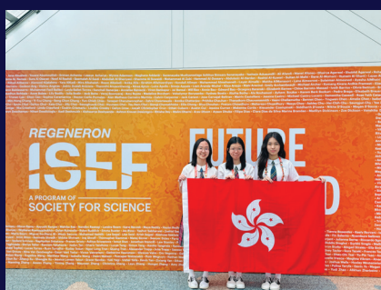
Regeneron International Science and Engineering Fair 2024 Hong Kong Delegation

聖保祿學校作為「資訊科技卓越中心」，致力推廣在教與學中應用最新資訊科技。本校支援學生網上學習，並引入嶄新的校本電子書研發項目，激發學生的創意思維和提升批判性思考能力、媒體欣賞及創作能力。本校成為政府資訊科技總監辦公室的合作夥伴學校之一，已於2015/16至2022/23學年間獲得港幣500萬元的資金，為中二至中六的學生提供資訊科技增潤培訓課程。該課程大大提升了本校使用資訊科技的氣氛、激發學生對資訊科技的興趣和在校園及社區中發掘資訊科技人才。