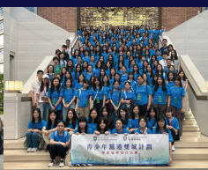
滬港青少年雙城計劃 AI FOR ALL 數字科技創業營 2024