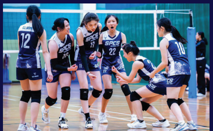
The Inter-School Volleyball Competition 2024 Division II (Hong Kong) B Grade Champion