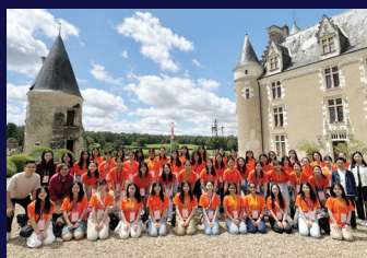
French Immersion Programme 2024