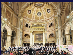
Italy Music Tour 2024