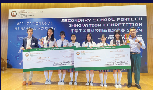
Secondary School FinTech Innovation Competition 2024 Champion Team