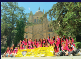
Spanish Immersion Programme 2024