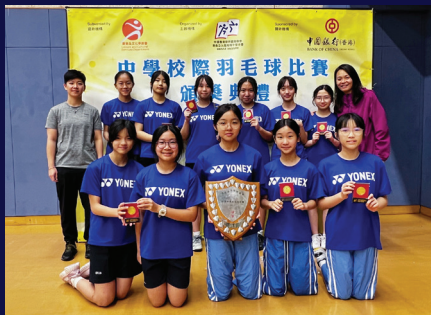
Inter-School Badminton Competition 2024 Division I (Hong Kong) C Grade Champion