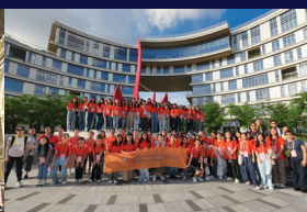
香港科技大學(廣州南沙) AI 夏令營 2024