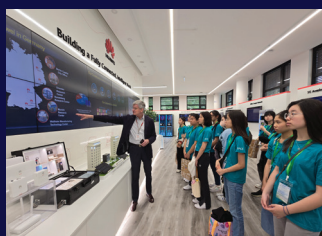
Germany "One Belt, One Road" Technology and Culture Exchange Tour 2024

電話號碼: 2577-2159 / 2576-1692 電子郵遞: spcsmail@spcs.edu.hk 學校網址: www.spcs.edu.hk